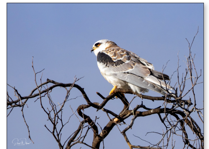
WHITE-TAILED KITE • ERIN WILSON