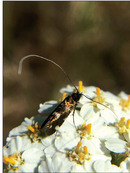
FAIRY MOTH • MERRIK BUSH

In August, September, and December, TRP assisted MDSP with fire defense projects around the residence at the Junction and South Gate Road. This was heavy chaparral on steep terrain and required over 400 hours of volunteer work.