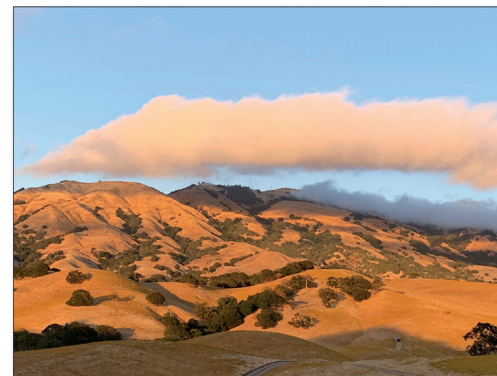
MOUNT DIABLO SUNSET • MIKE BRANDY