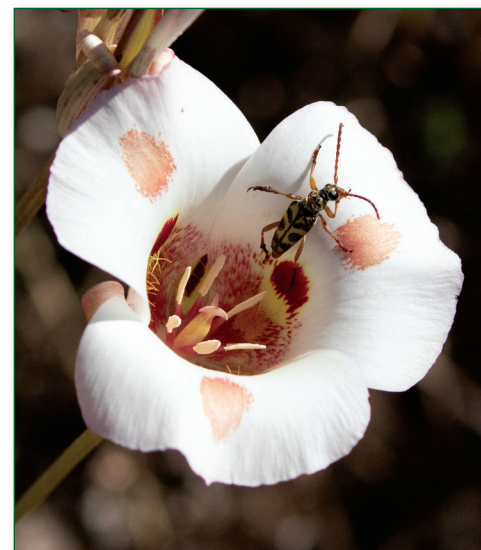
MARIPOSA LILY