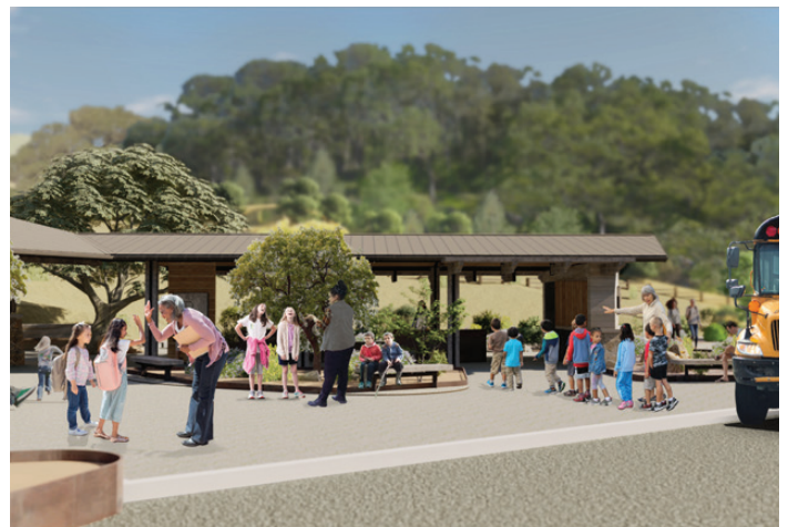
Proposed New MCVC