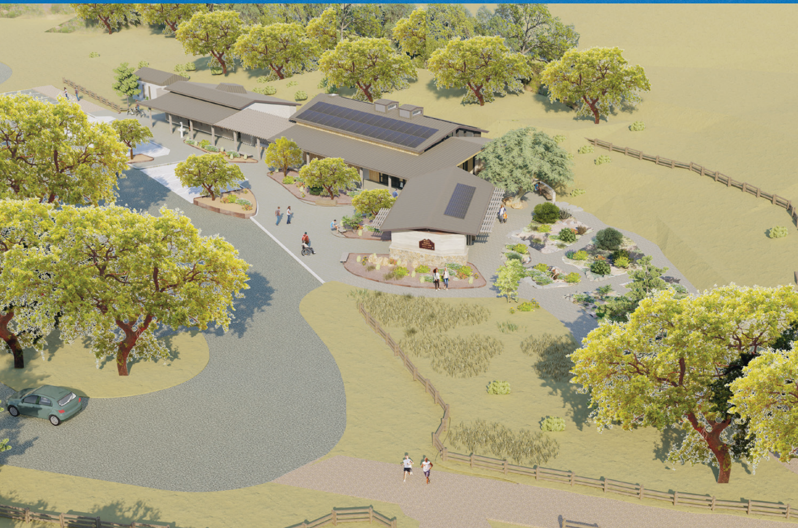
PROPOSED NEW MITCHELL CANYON VISITOR CENTER