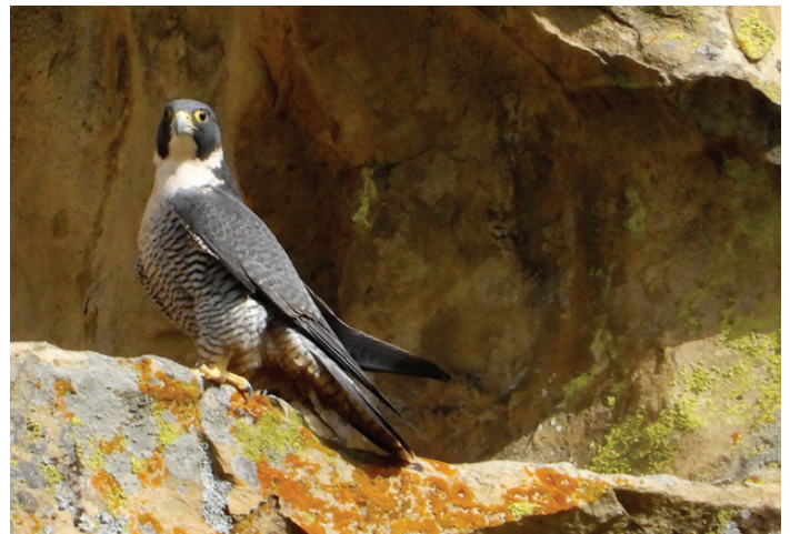
Peregrine Falcon.