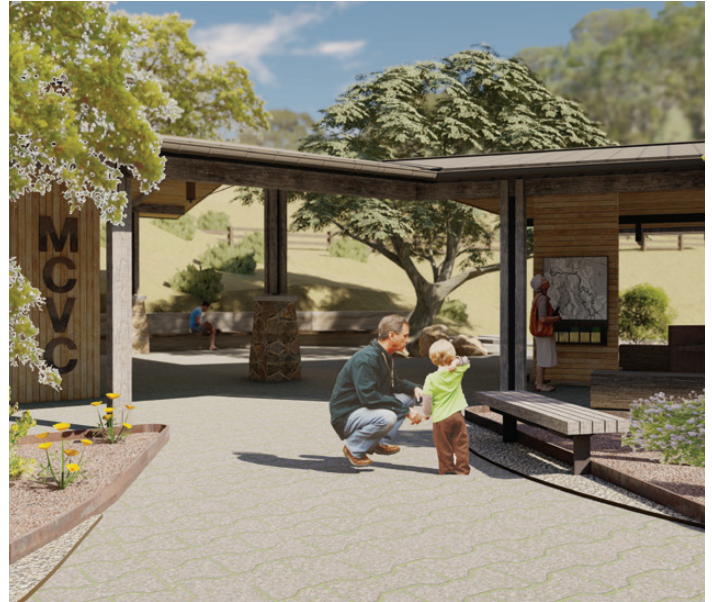
Proposed New MCVC Plaza

addition, there were four Summit Events that included Snakes and Tarantulas. MDIA thanks all the leaders and docent helpers who assisted. Through their efforts the hiking program continues to be a vibrant and popular asset to the Park and the public.