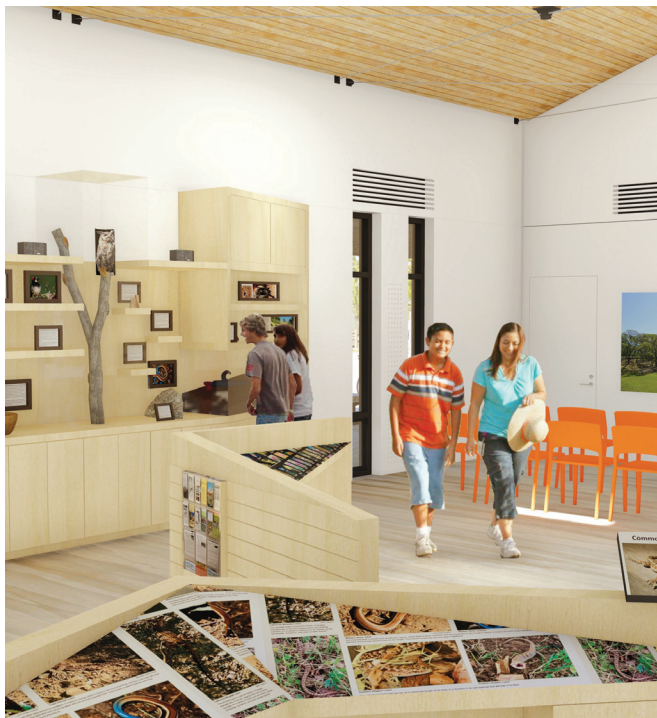
Proposed Education Center | Ware Associates