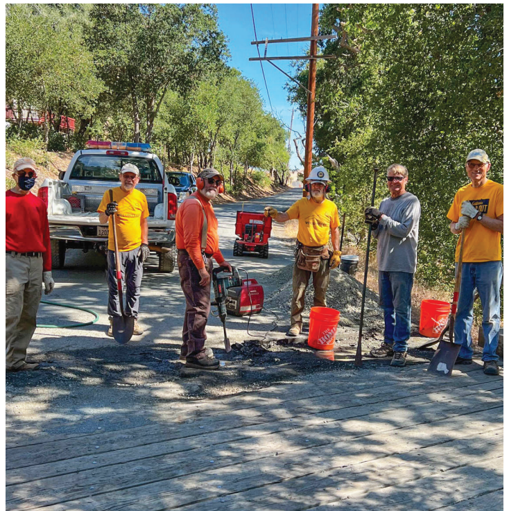
TRP Volunteers Repairing Mitchell Canyon Road

The State is still reviewing several proposed projects, and the TRP crew is ready to assist in maintenance and to accomplish more to bring the park back to as natural state as possible.