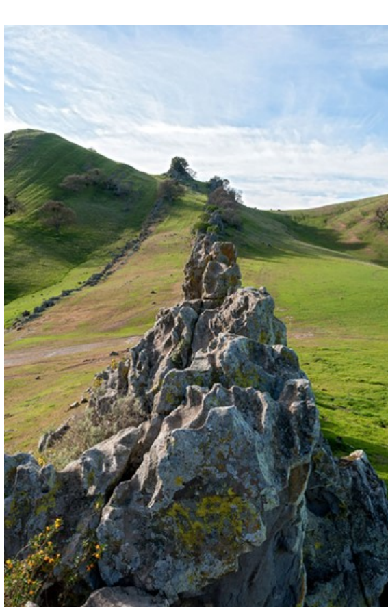
China Wall by Bill Karieva

There are, of course, all kinds of reasons for picking a particular hike as a favorite. It may be the memory of an unusually pleasant day in a hidden corner of the mountain bursting with spring's colorful growth. It may be an exceptionally challenging single-track trail meandering through a wonderland of rocks and breathtaking views. Or it may be a destination hike—a hike featuring some unusual climactic phenomenon that repeatedly draws you back. An excursion to China Wall is one such destination hike, and if you have never experienced China Wall, you owe it to yourself to devote a part of a beautiful day to explore this masterpiece of nature at the end of a short, pleasant walk.