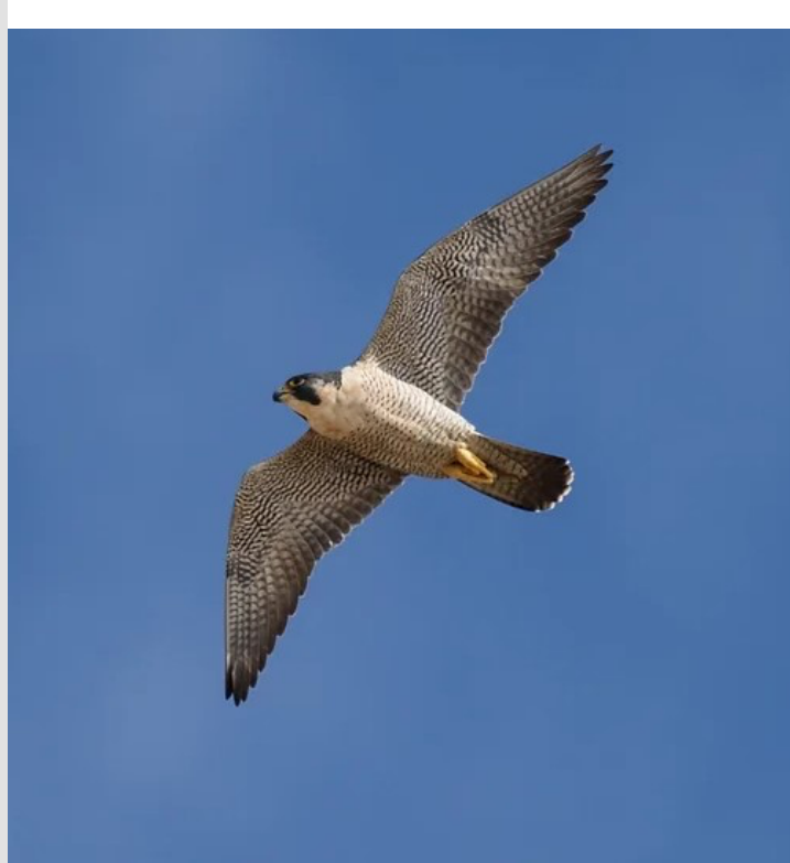
Peregrine in flight