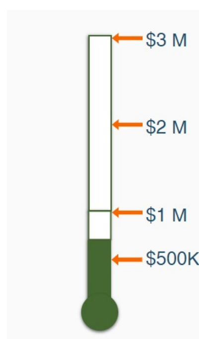
Help us meet our goal of $1M in 2023