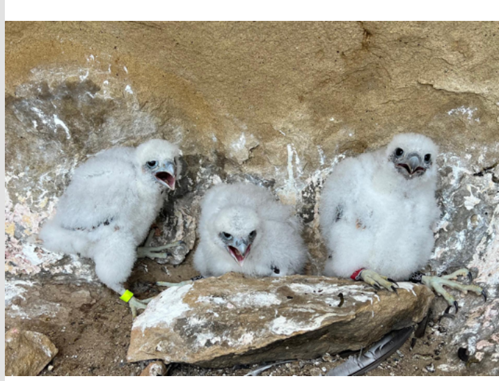
Peregrine chicks