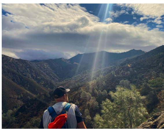
Me looking toward Summit

It is why I became a volunteer here and certainly why I dedicate myself to leading this wonderful organization that seeks to spark that imagination in everyone who visits. It is why I am passionate about building an education center in Mitchell Canyon so that we have the best tools available to imbue those who come with the same sense of ownership that I have. And to make it their mountain .