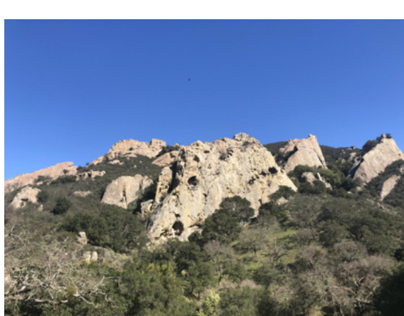
Castle Rock by Steve Smith

This hike starts from Macedo Ranch at the end of Green Valley Road in Alamo. China Wall is a terminally eroded sandstone stratum, tilted into vertical position by the upthrust of Mount Diablo. With adjacent strata eroded away more rapidly, the remnant is, indeed, a wall-like structure running over hill and dale, just like its man-made equivalent in China. Take time to examine the grotesquely convoluted formations, sculpted by an imaginative Mother Nature; small paths made by previous explorers facilitate your examination.