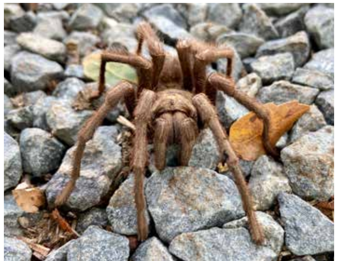
Desert Tarantula

MDIA HOSTED 50 PUBLIC HIKES and walks in 2025, including First Day, Chaparral Spring, Wonder, Geology, Wildflower, Pollinator, History, Solstice, Common Poorwill, Tarantula, Scorpion, Halloween, Green Friday, and Winter Solstice Hikes. We also organized 6 additional MDIA-led hikes throughout the year. There's a hike for everyone—visit mdia.org/events to find yours.