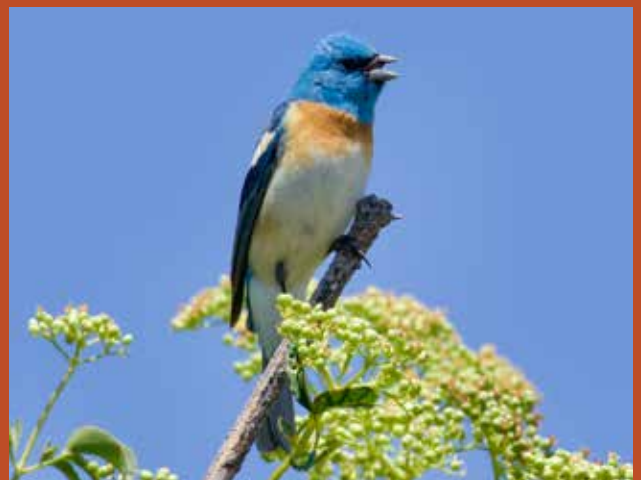
Lazuli Bunting

Mount Diablo Interpretive Association (MDIA) is a nonprofit, all-volunteer organization that supports the California Department of Parks and Recreation in maintaining and interpreting Mount Diablo State Park for its hundreds of thousands of annual visitors. MDIA works side by side with State Park staff to enhance the visitors' experience and appreciation of the park.