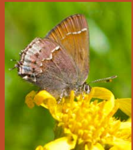
Mui's Hairstreak on Narrowleaf Goldenbush