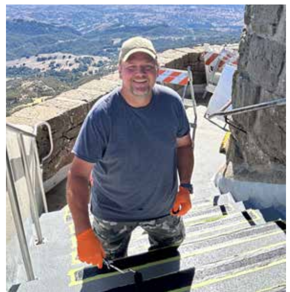
Steve Smith Waterproofing Summit Building

SEVERAL ONGOING MAINTENANCE PROJECTS include repair and replacement of historic CCC era picnic tables in collaboration with the Diablo Woodworkers group and the Diablo Stove Team. The stone mason volunteers have continued work on Diablo Stoves, erosion control, and other park projects. Work is ongoing in maintaining and refurbishing 16 trail map kiosks throughout the park. Work continues to keep the waterproofing in good repair at the Summit Building. The second part of a long-anticipated trail sign order was filled with 40 new signs replacing many dilapidated and worn signs throughout the park. Most notably is the replacement of nearly 20 signs in the Perkins Canyon area of the park where signs that merely read "Trail" have been replaced with actual trail names.