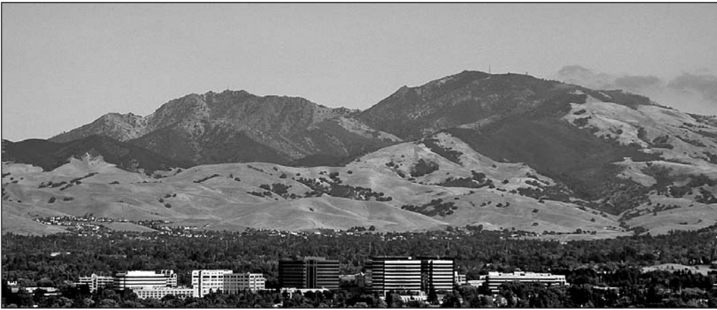
taken from Pleasant Hill.