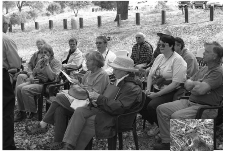
Annual meeting of MDIA held in Mitchell Canyon. (with an additional guest)