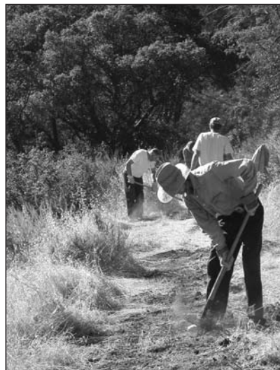
Clearing the Globe Lily Trail, moving dirt for better winter runoff.

All because you, were a member of the Trail Crew.