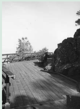
Stop 6—A good place to rest for a minute.