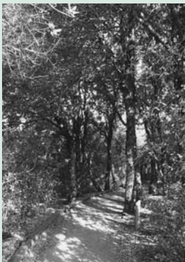
Stop 1—Trail begins in a grove of scrubby oaks.

Mt. Diablo State Park's Fire Interpretive Trail , at the summit, was named in her honor on 5-22-1982. Late last year, the trail was officially renamed the "Mary Bowerman Trail." A formal dedication ceremony is expected to be held by Save Mount Diablo .