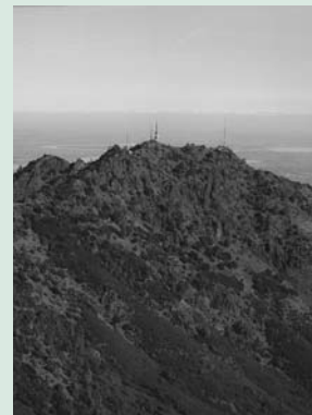
Stop 7—Turn the corner, North Peak is in front of you.