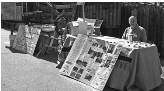
Harvey Brosler, MDIA display at the Heritage Day celebration